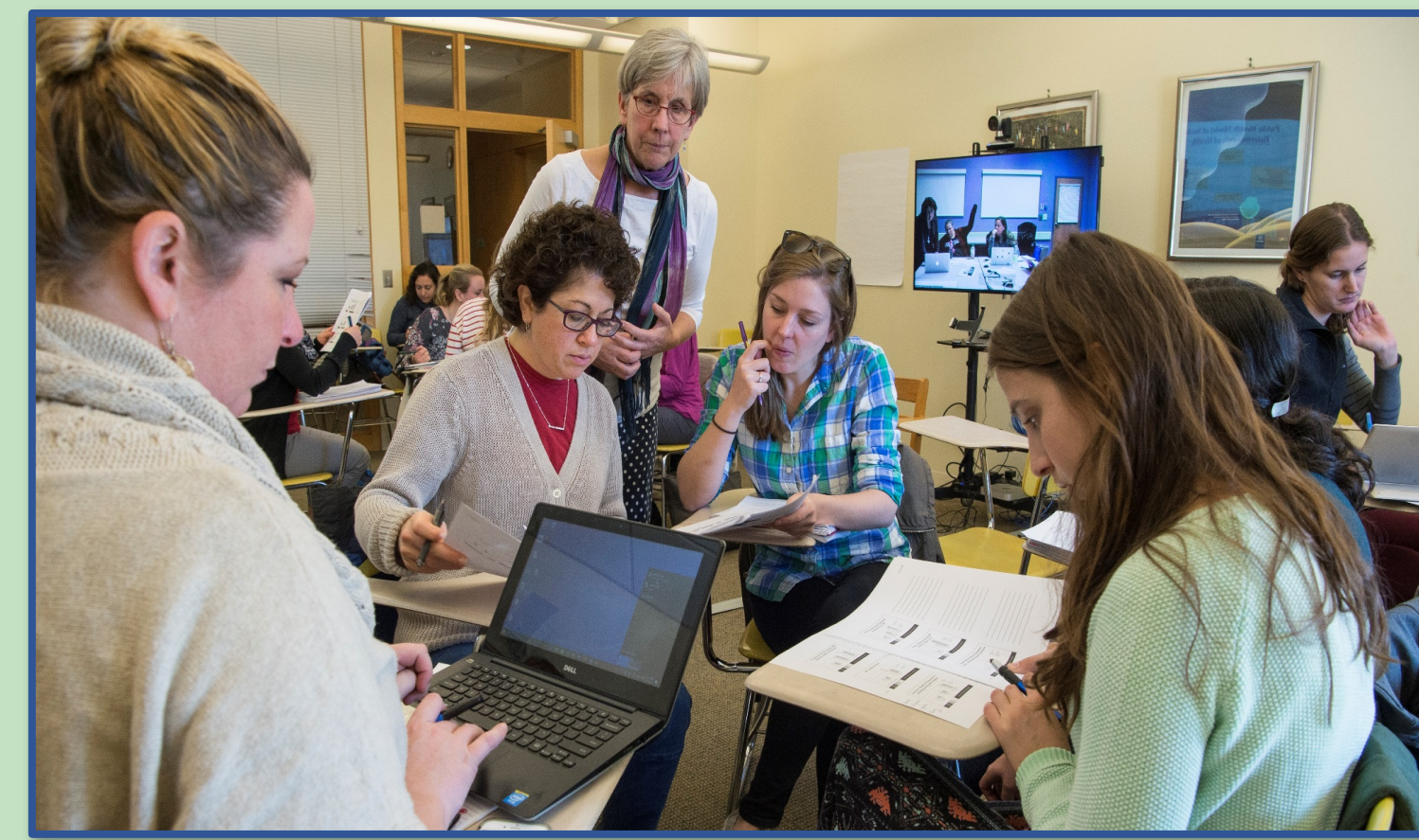
UNH and UMaine LEND trainees and faculty engage in Team-Based Learning in weekly seminars via video conferencing using Zoom technology.