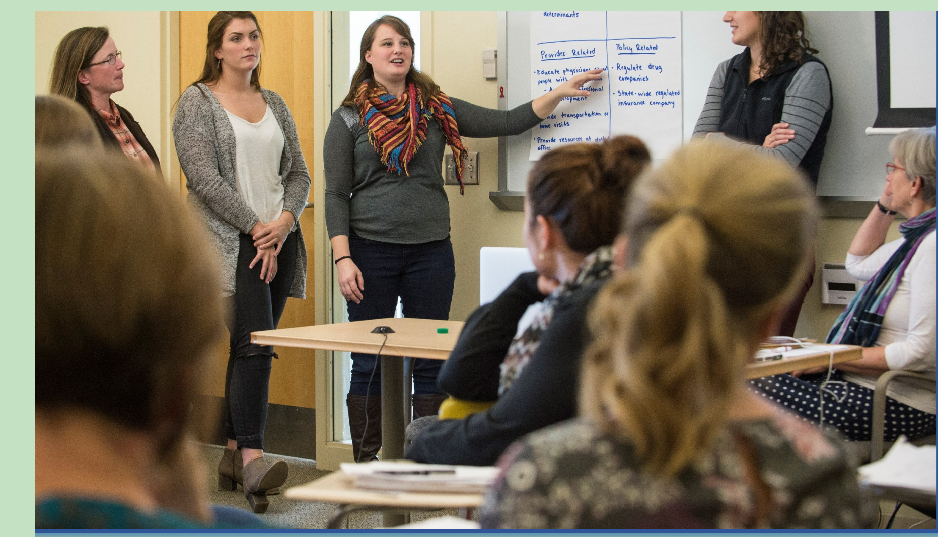
LEND trainees share their discussions based on case-based application activities.